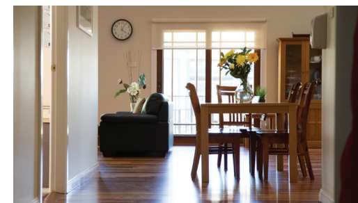
A tranquil home environment.

Centrally located in Hamilton, our beautiful, newly renovated federation home offers a tranquil home away from home experience that is unique in the Hunter.