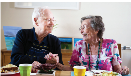
Home cooked meals, friendship and activities.

Ask us about day, overnight, emergency and planned respite care in our cottage or in your own home. Ailsa Craig Cottage is Newcastle's only privately owned, overnight respite house.