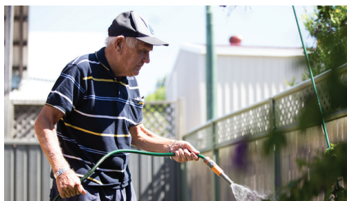
A vegie patch, BBQ and men's shed.